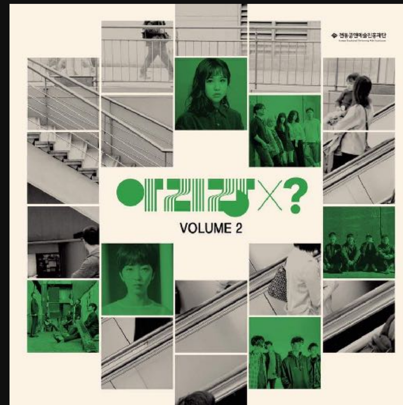
2019.1.25. Arirang x ? Vol.2 Compilation Album [Moon Shadow]