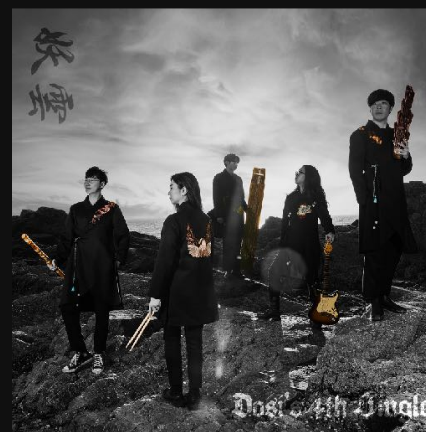
2021.4.9. 4th Single [Ominous Cloud]