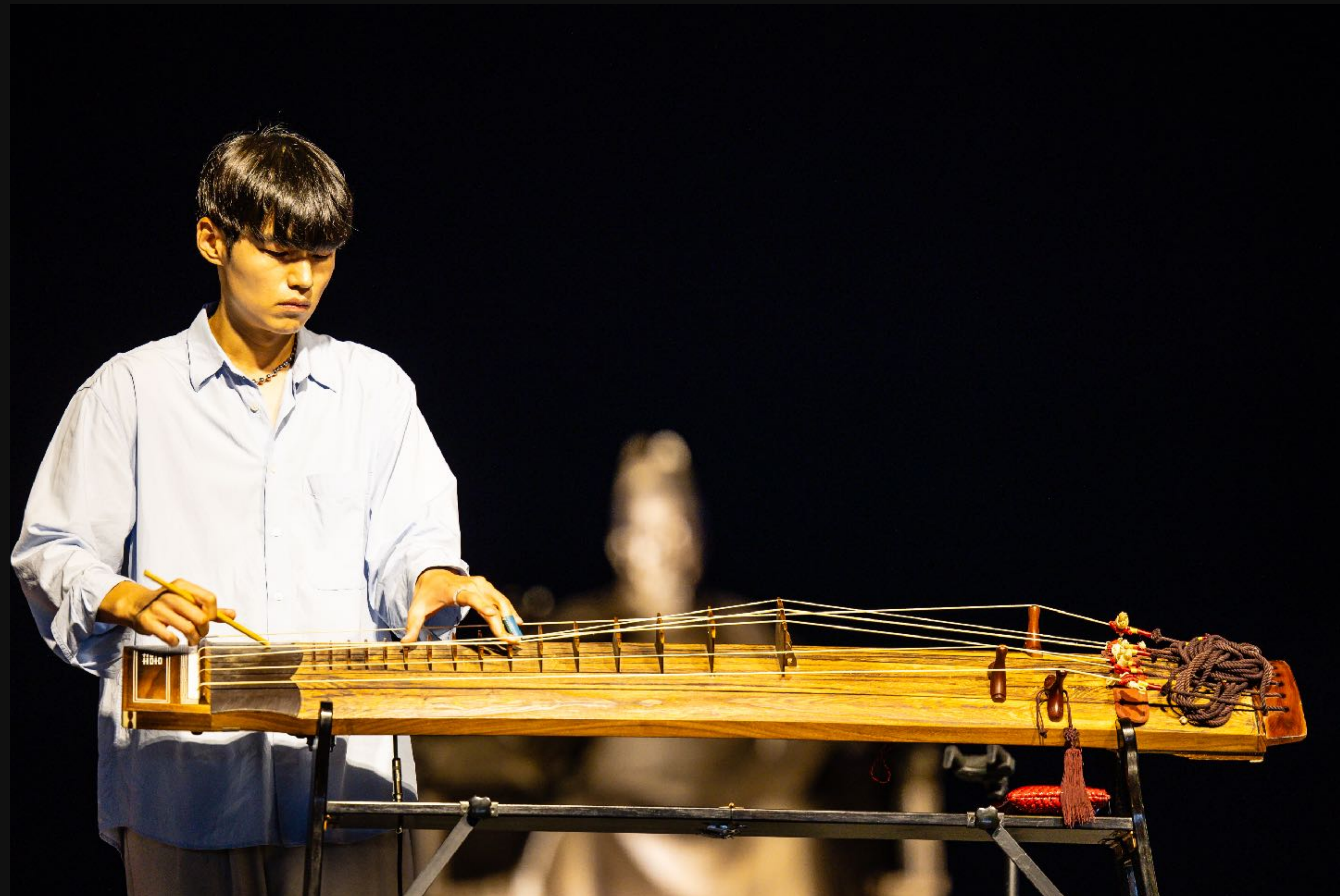
Geomungo and Bass Guitar Arrange, Planning and Marketing

Graduated from Chung-Ang University's Department of Gugak Orchestra Graduated from Master's degree at Korea National University of Arts and Traditional Arts