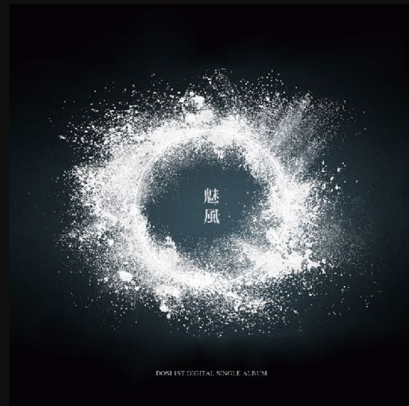
2019.1.24. 1st Single [The Wind Of Goblin]