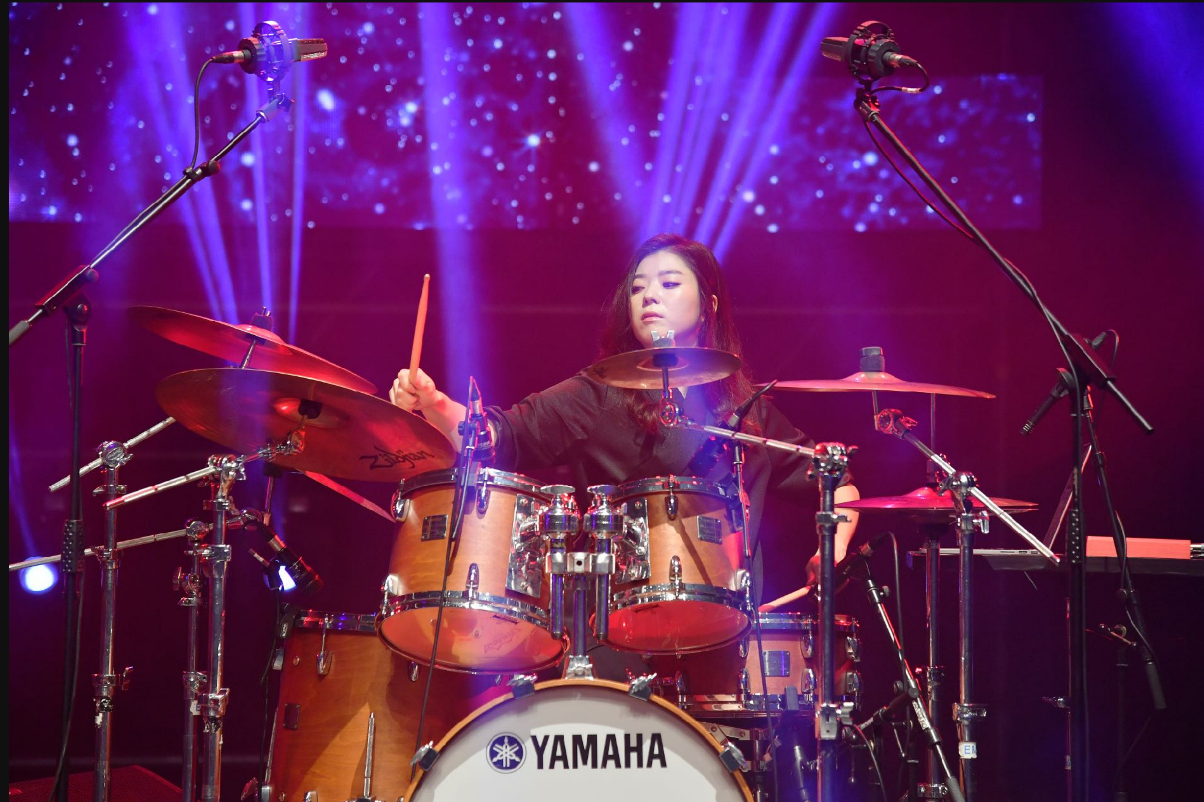
Drums and Percussions Arrange and administration

Creation Section of the Sichuan World Percussion Competition