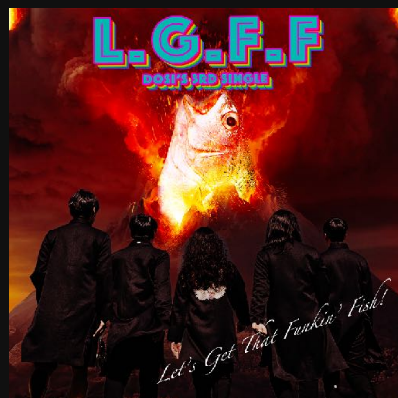
2020.4.9. 3rd Single [L.G.F.F.]