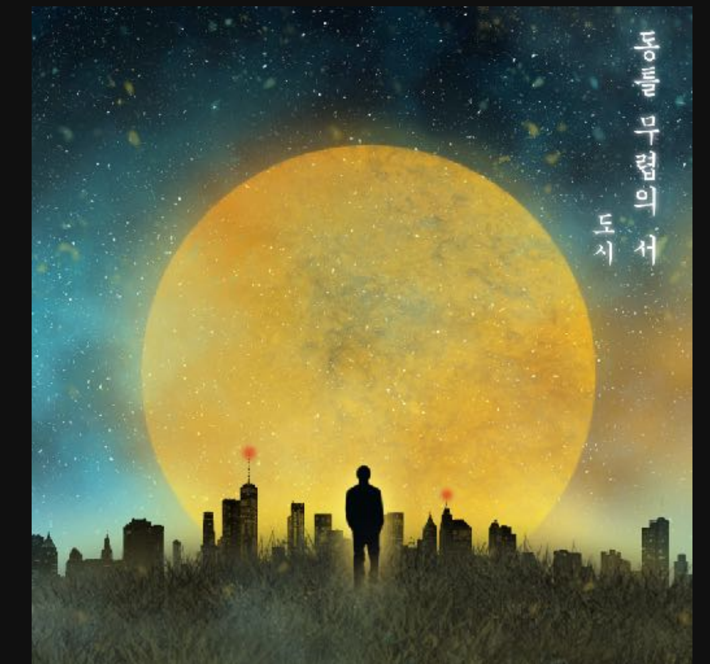
2019.5.9. 2nd Single [Dawn]